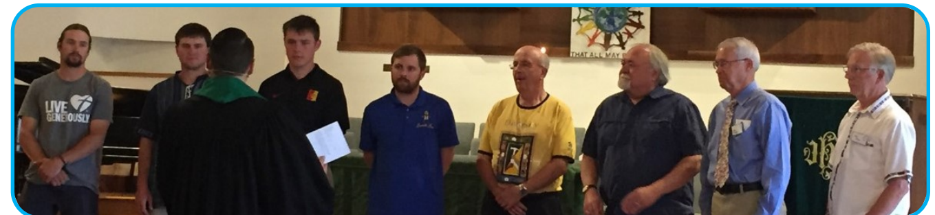
Blessing the Habitat Guatemala Mission Team