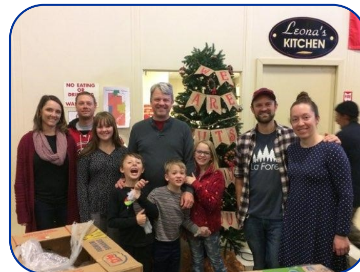
Volunteering at the Weld Food Bank in December